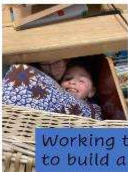
Working together to build a den.