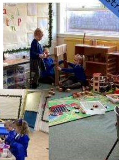
Construction area fun!