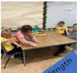
Comparing length with slime.