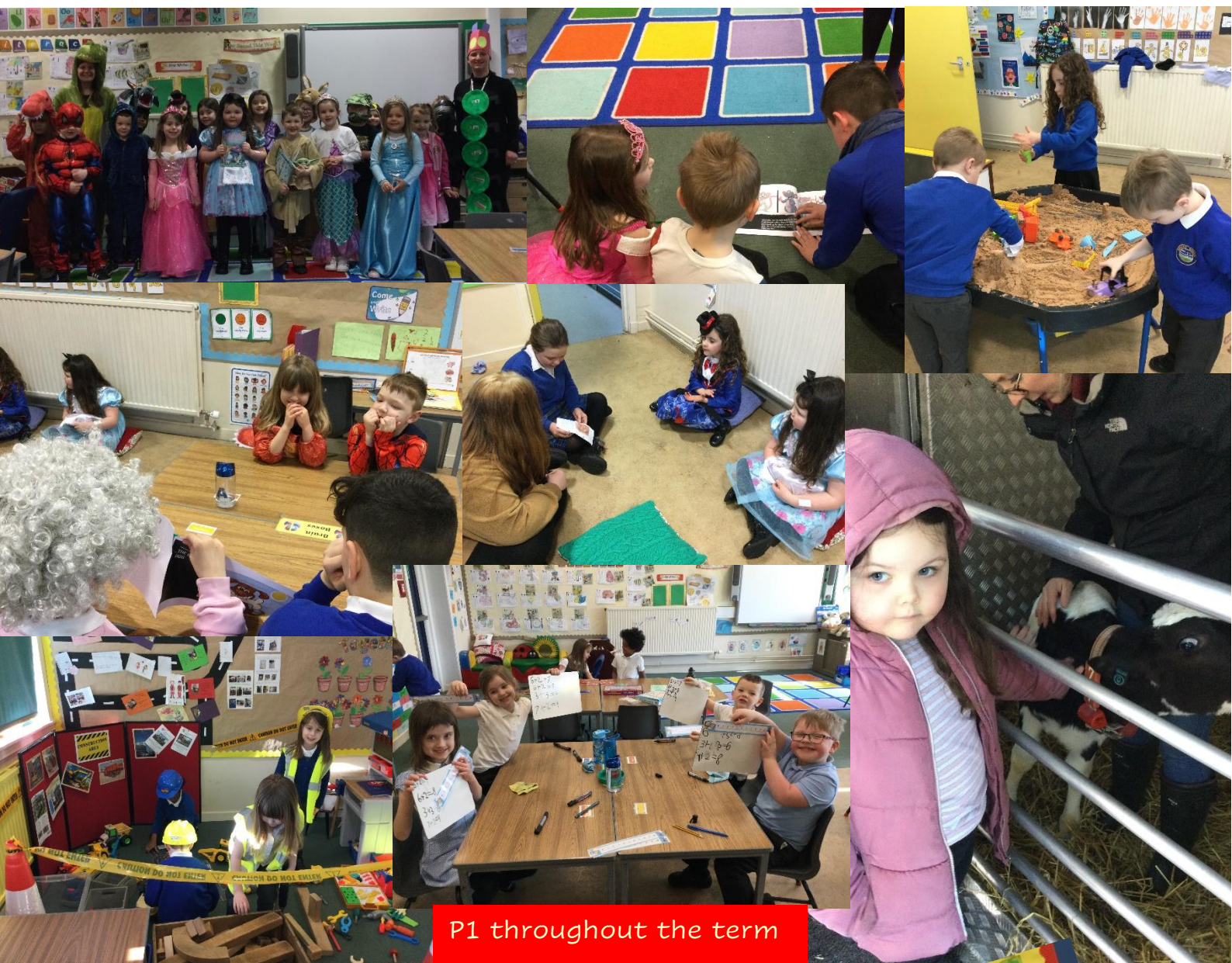
P1 throughout the term