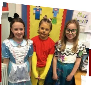
World Book Day in P5/6