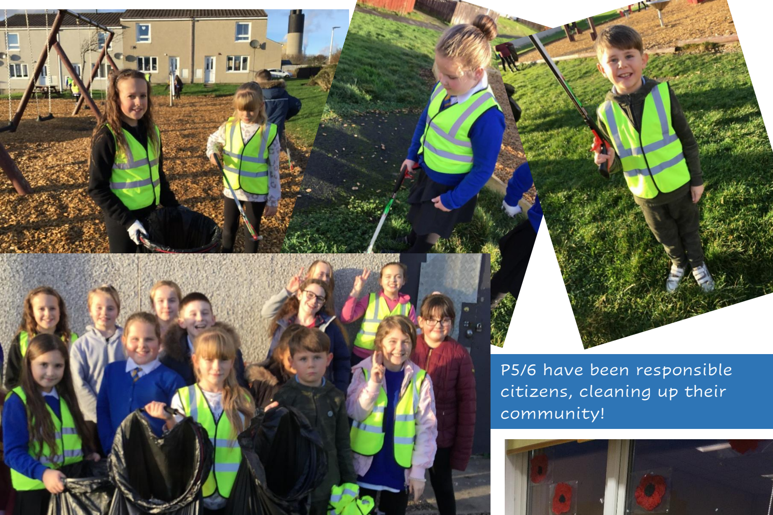
Lest we forget