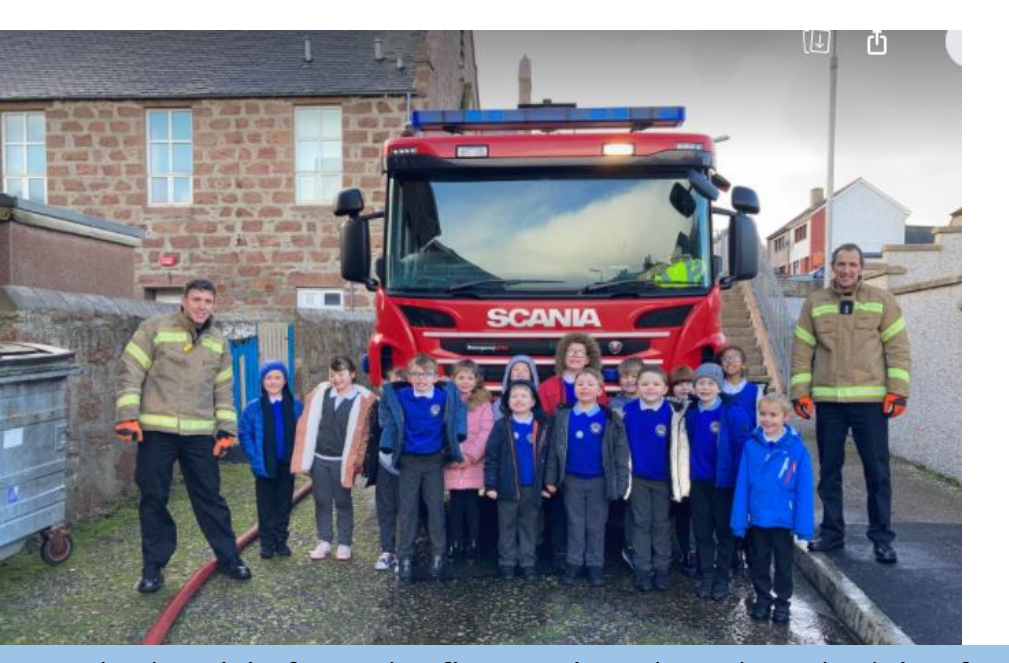
P2/3 had a visit from the fire service, they shared advice for keeping safe on bonfire night.